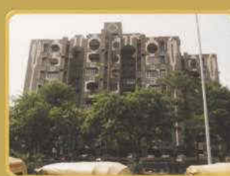
Arur Co-operative Apartments Plot 10, Mayur Vihar Phase 1, Delhi Consisting 91 Units