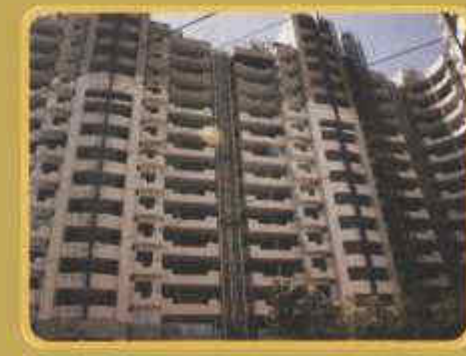
APEX Green Valley Sec - 9, Vaishali, Ghaziabad Consisting 123 Nos. of Supper HIG Appts.