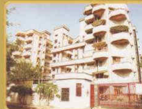
New Adarsh Apartments Plot - 22, Sector - 10, Pappan Kala, Dwarka, New Delhi, Consisting 79 Units