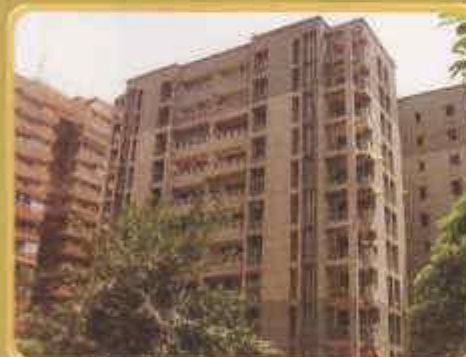
Media Times Sehkar Awas Apartments Abhay Khand - 4 Indirapuram, Ghaziabad Consisting 128 Units