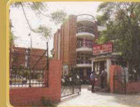
Kala Vihar Apartments Mayur Vihar Phase - I, New Delhi Consisting 140 Units