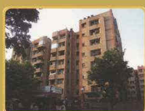
DSIDC Co-operative Apartments Plot 23, Sec - 9, Rohini Delhi Consisting 135 units