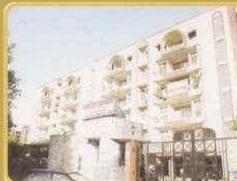
Anuradha Sehkar Awas Apartments Plot 1, Sector - 3 Indirapuram, Ghaziabad Consisting 80 Units