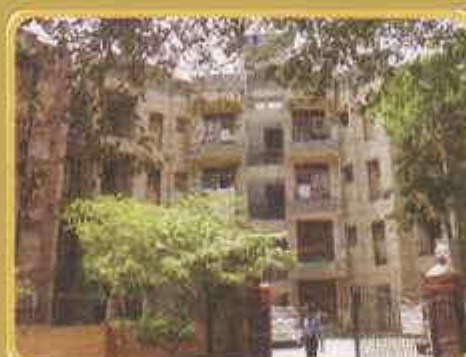
Nanda Devi Apartments Plot - 19, Sector - 10, Pappan Kala, Dwarka, New Delhi, Consisting 75 Units