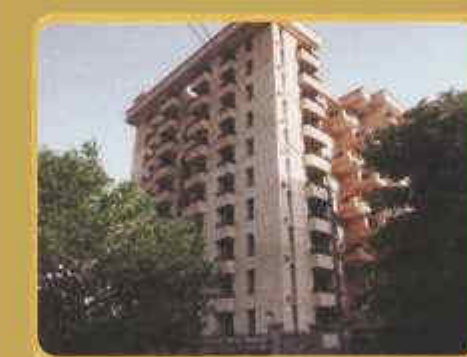
Khattar Co-operative Apartments Consisting 100 units