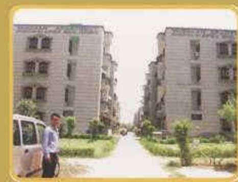
Vardan Sehkar Awas Apartments Abhay Khand - 3 Indirapuram, Ghaziabad Consisting 88 Units