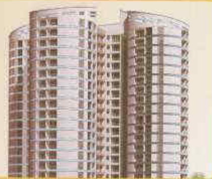
Apex Acacia Valley Sec - 3, Vaishali, Ghaziabad